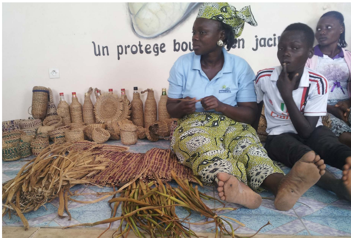
Handicrafts objects made and marketed by women groups