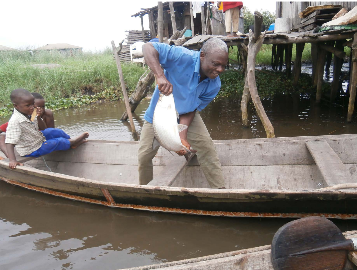
← Inland fishing in southern-Benin

Fishing remains the principal activity in coastal areas of Benin and is directly experiencing the negative effects of changes in climate parameters. This study, focused on fishing communities of Grand Popo and Ouidah in southwestern Benin, adopted an integrated approach that took into account both biophysical and socio-economic factors that determine the vulnerability within a community or a household. Indicators were used to develop a composite index of vulnerability. The findings of the study showed that for fishing, Grand-Popo was more vulnerable to climate variability and change