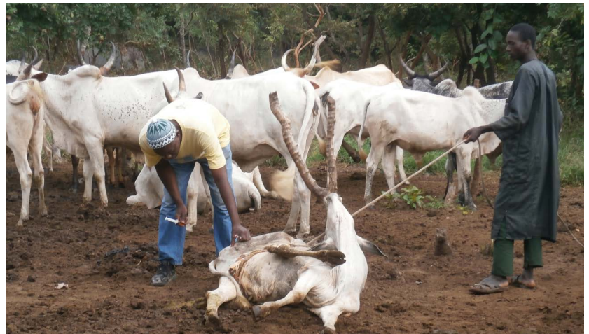
Herd receiving care, Central-Benin ⇒

of Mid-Benin to climate variability and change. A composite index and qualitative methods were used to quantify the vulnerability and explain how it was influenced by the exposure, sensitivity and adaptive capacity. The findings revealed that the most vulnerable were not necessarily the most sensitive or exposed. Also, socioeconomic features influenced the level of vulnerability within households.