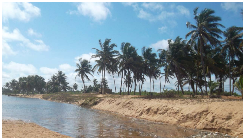
Coastal erosion at Ouidah, Southern-Benin ⇒

wind) in the Grand-Popo and Ouidah sector, map the flood risk and characterize the sea level rise and coastal erosion in the Grand-Popo and Ouidah sector. This study was mainly biophysical and outcomes will be published in early 2015. The study was part of research activities of the Benin coastal areas adaptation to climate variability and change project (PACC) funded by the Canadian International Development Research Centre.