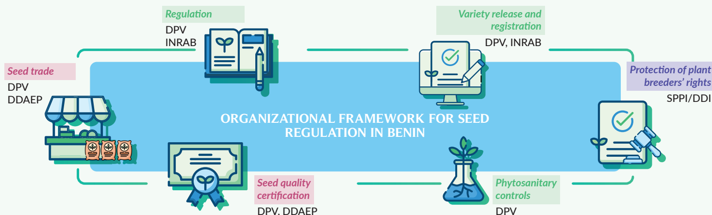
Figure 1: Organizational framework 1 for seed regulation in Benin

A key constraint is the low penetration of improved/certified seeds among vegetable growers due, among others, to institutional, technical, human, material, and financial capacity gaps in the vegetable seed regulatory system (Figure 1). With support from the Netherlands Food Partnership through the Seed Law Toolbox program, an assessment is carried out to identify those capacity gaps and formulate an action plan that proposes capacity imperatives to improve the system. The assessment adopts an interactive and transdisciplinary approach that combines a review of policy documents with stakeholder consultations and perspectives to generate an acceptable roadmap for agricultural policies. Specifically, the methodology used the following three steps: describe the vegetable seed regulatory system, undertake a capacity needs assessment of key institutions, and formulate a plan to improve the capacity of these institutions.