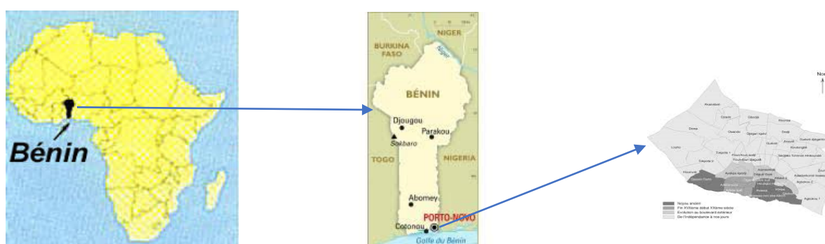
Fig. 1 Geographical location of Porto-Novo (designed from google images, 2017)

The Republic of Benin is located in West Africa, and Porto-Novo its capital is located in the south-east of the country (Figure 1). The area of Porto-Novo is 110 km 2 , about 1.08% of the national territory area. Porto-Novo has eighty-six (86) districts. The climate is subequatorial, and the average of temperature is 28 °C. The month of March is the warmest (32 °C), and the month of August is the least hot (24 °C). The rainfall pattern includes two rainy seasons and two dry seasons of unequal duration. Usually, it rains from March to July (big rainy season) and from September to November (small rainy season). The annual rainfall is estimated at 1200 mm/year. The rhythm of the seasons has been disturbed in the past twenty years. Adaptation to climate change is essential for the resilience of agricultural and food systems (Bellon and Van Etten, 2014, Folke, 2006).