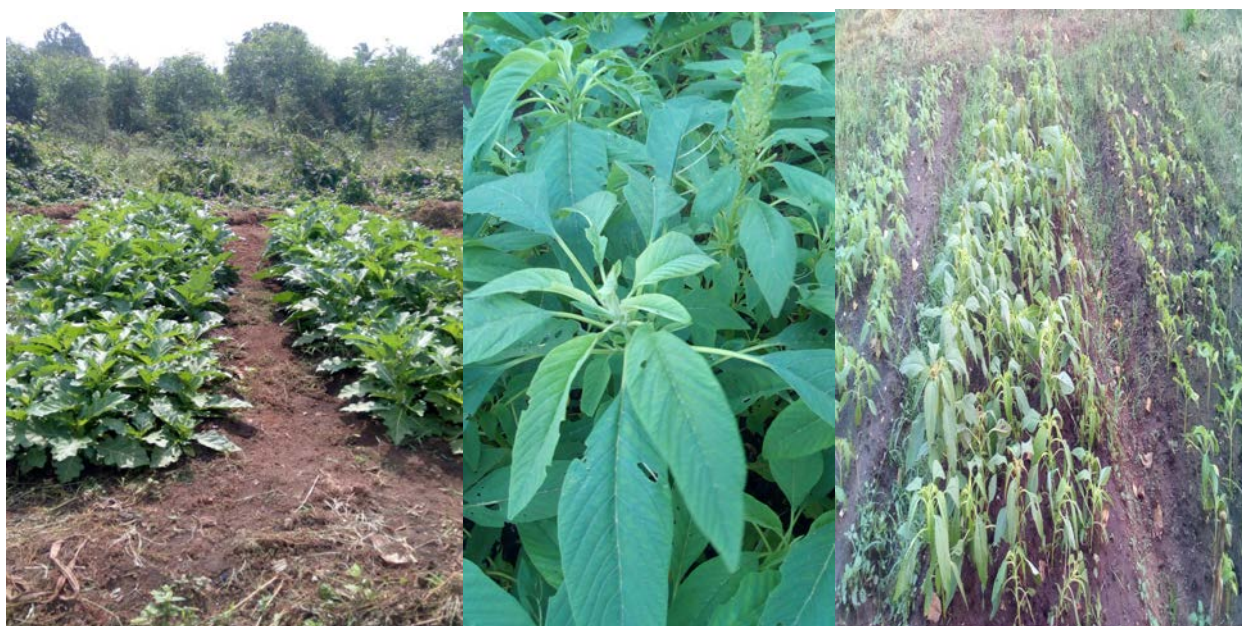
Fig. 3 Leafy vegetables at Porto-Novo

According to area rough estimate made on the basis of declarations (Table 2), 15.85142 hectares of land are cultivated for urban garden products in Porto-Novo. Nine (9) out of the seventeen (17) districts are home for more than 85% of the total area.