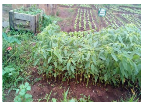
Fig. 2 Leafy vegetables at Porto-Novo

According to area rough estimate made on the basis of declarations (Table 2), 15.85142 hectares of land are cultivated for urban garden products in Porto-Novo. Nine (9) out of the seventeen (17) districts are home for more than 85% of the total area.