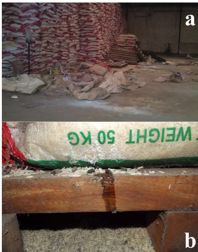
Figure 2. Images de l'intérieur des entrepôts du Port Autonome de Cotonou avec (a) des piles de sacs de riz, (b) du riz jonchant le sol et des fèces et de l'urine de rongeurs — Pictures of inside Cotonou seaport storehouses showing (a) rice bags piles, (b) wasted rice on the floor as well as rodent urine and feces.